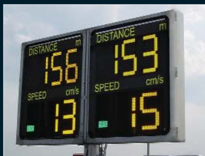
iMoor large LED display