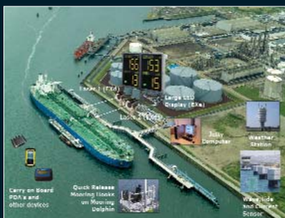
Mampaey innovations: The iMoor pro active jetty management system