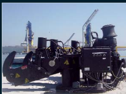
Quick release mooring hooks, with capstan