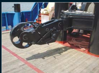
Quick release towing hook