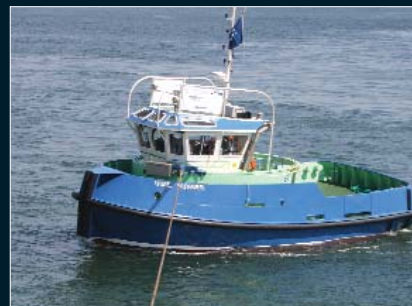
Mampaey innovations: The Dynamic oval towing system (DOT)